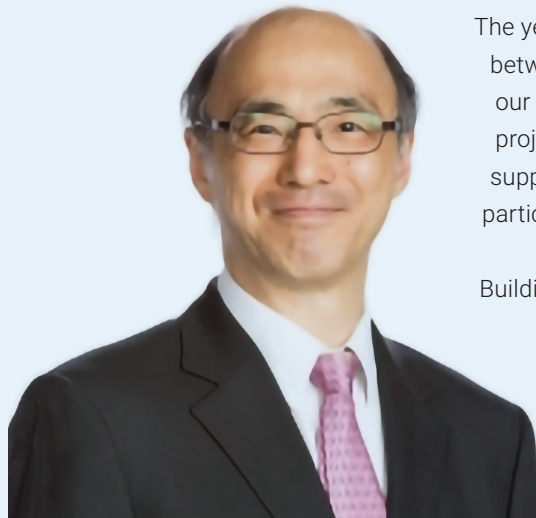
H.E SHINDO YUSUKE