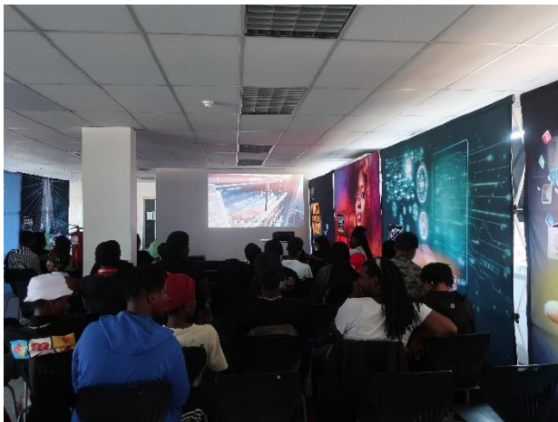
Limkokwing University of Creative Technology (Botswana)