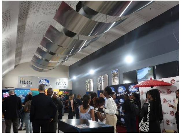
Opening event at Cinema