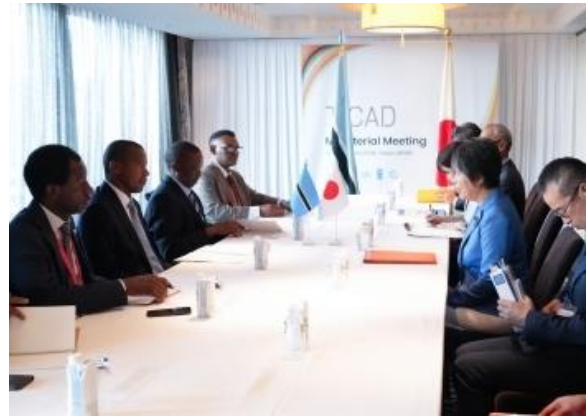
Japan-Botswana Foreign Ministers' Meeting

Tokyo, 25 th August 2024 – Ms. KAMIKAWA Yoko, Minister for Foreign Affairs of Japan, held a meeting with Hon. Dr. Lemogang KWAPE, Minister of Foreign Affairs of the Republic of Botswana who is visiting Japan to attend the Tokyo International Conference on African Development (TICAD) Ministerial Meeting. The overview is as follows.