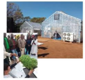
Green house, IMEC system: water-saving agriculture

in Botswana, through the United Nations Children's Fund (UNICEF), in 2022/23. Furthermore, Japan donated child friendly police centres and medical equipment to address malnutrition, through UNICEF, in 2021/22.