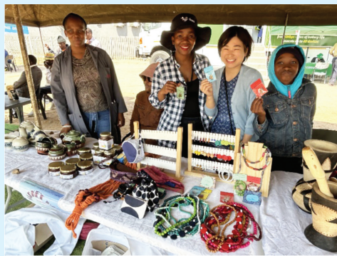
JICA Volunteer (Community Development)

government agency, it conducts its cooperation in line with Japanese government policies and initiatives. One of those initiatives is TICAD, a multilateral platform for African Development, initiated by the Japanese government in 1993. 2023 celebrates TICAD's 30th anniversary. The ABE initiative which specifically targets African countries, was launched in 2013 during TICAD 5, this year is the 10th anniversary of the programme.