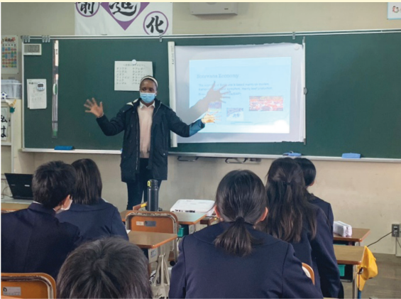
Teacher Training at Junior high school in Japan

Degree), while others have undergone teacher training. Some have received various government scholarships through University recommendations.