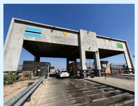
Technical Cooperation for Kazungula Bridge and One Stop Border Post