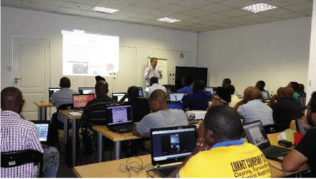
Workshop in Gaborone: learning about geological survey technology (2019)