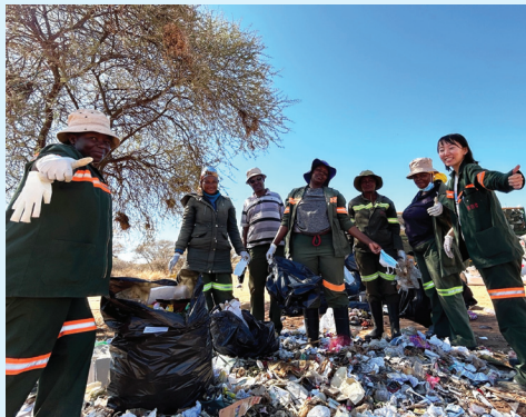
JICA Volunteer (Waste Management)