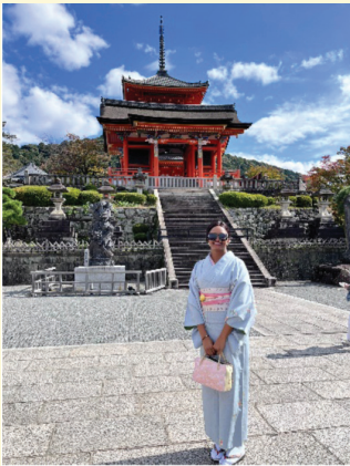
Private Visit to Kyoto