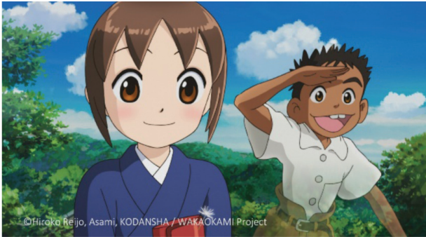
Japan Film Festival in October 2023