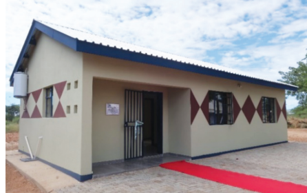
Walk-in cold room, to improve the vaccine cold chain