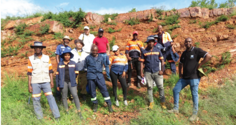
Field survey conducted with the Botswana Geoscience Institute (BGI) (2022)