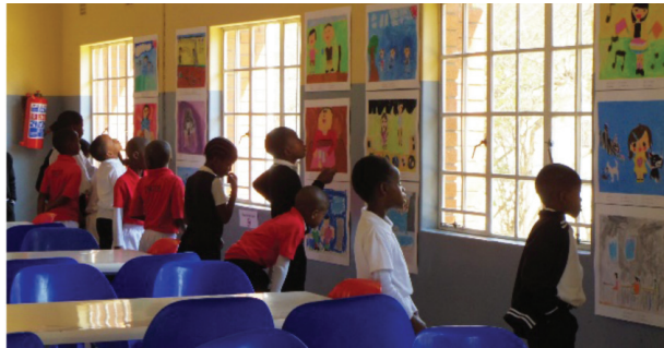
Painting Exhibition at Ben Thema Primary School in November 2023

The Japan Film Festival will be held at New Capitol Cinemas, Riverwalk, Gaborone from 5th -7th October 2023.