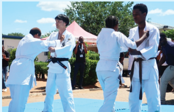
JICA Volunteer (Judo)