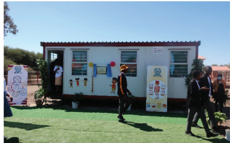
A child friendly police centre in Shakawe Community, to address the issue of GBV