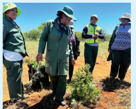
Technical Cooperation for Forest Management