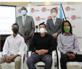
Award ceremony for Logo and Character Competition