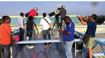
Project for Implementation of the Digital Migration Project: Filming Stadium (JICA)

JOGMEC Japan Oil, Gas and Metals National Corporation Since JOGMEC Botswana Geological Remote Sensing Center opened in 2008, JOGMEC offered training, conducted analysis and survey of mineral resources. JOGMEC transfers technology using remote sensing to the Southern African Development Community and, since its establishment, over 1,800 people have participated in the training.