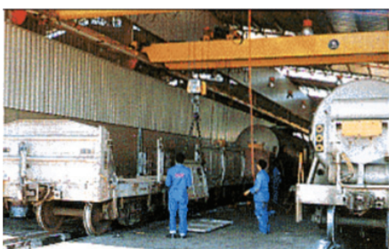
Railway Rolling Stock Increase Project