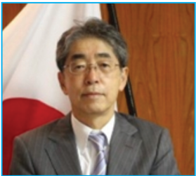
Ambassador of Japan to Botswana

What is the first image that comes to mind when you think of Japan? Do you think of cars, TVs, electronic gadgets? Or maybe animation, sushi, or samurai? Is it the just ended Tokyo 2020 Olympics and Paralympics or karate or judo? Each of these images is correct and portrays an integral part of Japan.