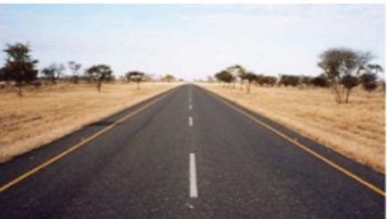
Trans-Kalahari Road Construction Project