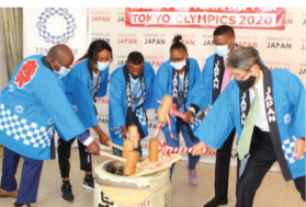
100 Days Countdown Pep Rally Reception for the Tokyo Olympic Athletes