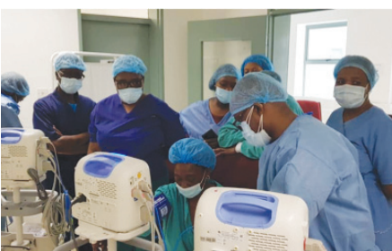
Provision of Bed-side Monitors