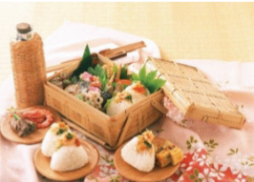
Food tasting events