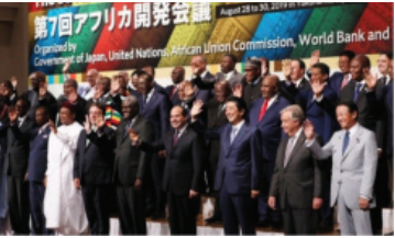
TICAD 7

civil society and the private sector. With its existence of over a quarter of a century, TICAD has over the years, continuously supported African-led development by raising the awareness of the international community towards African issues, under the basic principle of "African ownership" and "international partnership". Next year, in 2022, TICAD 8 will be held in Tunisia. The Japan-Botswana cooperation will continue, as we look towards the success of TICAD 8.