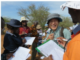
Remote Sensing Workshop: A geological field inspection by Japanese Specialist and Batswana colleagues (JOGMEC)