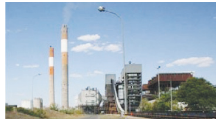
Morupule Power Station Expansion