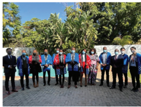
Batswana who studied in Japan reunite on the Star Festival, Tanabata