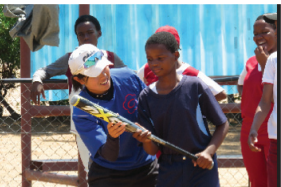
Chukyo University team teaching soft ball techniques to local schools