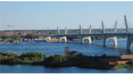
Kazungula Bridge Construction Project