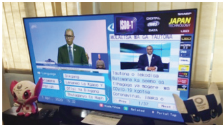
Digital Terrestrial Television providing information in Setswana