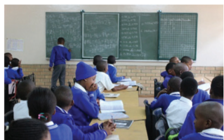
Construction of Primary School