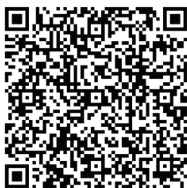
Check out a movie on the 55years of relations