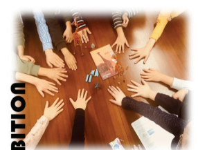
55 th Anniversary of Diplomatic Relations between Japan and Botswana 26 October - 8 November 2021 9:00 - 16:00 Venue: Theopang Visual Arts Centre Admission Free