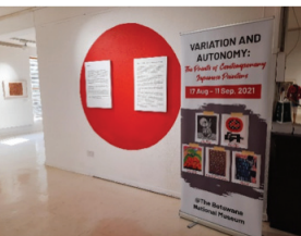
Japanese Art Exhibition - Variation and Autonomy