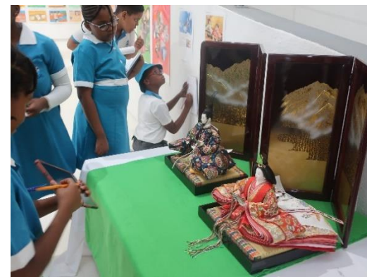
Hina ningyo , Japanese traditional dolls