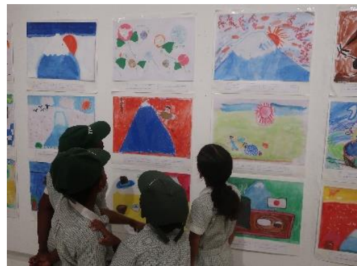
Students from neighboring primary school