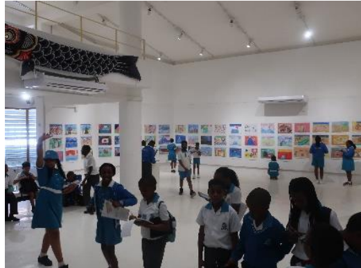
Students from neighboring primary school