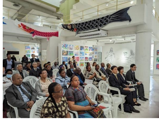
Participants for the opening Ceremony