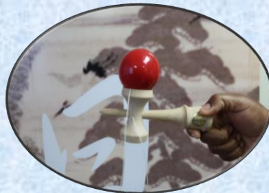
• Kendama Lessons