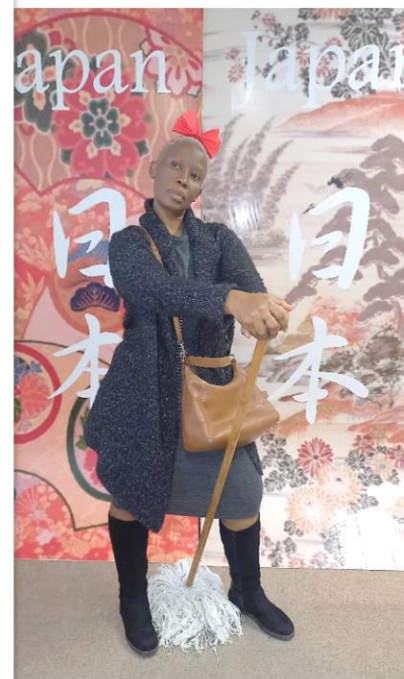
Japanese Anime Cosplay