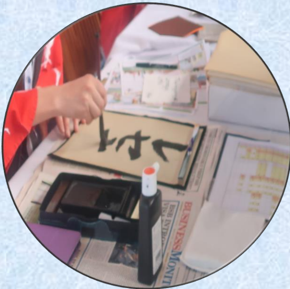
• Calligraphy Demonstrations

*Cosplay is the practice of dressing up as a character from Japanese Anime, Manga or Video Games.