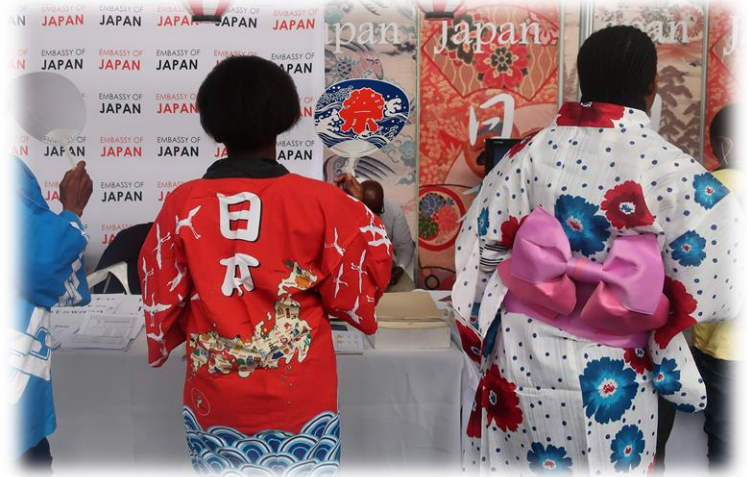
Fitting of Yukata and Happi

FROM MON, 28TH AUGUST TO SUN, 3RD SEPTEMBER @ Fairground Holdings, Gaborone, Stalls D06 & D07, Ditshupo Hall