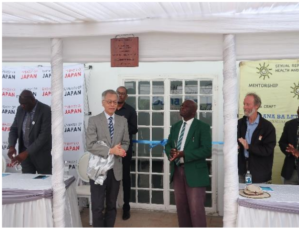
Official Opening of the Centre