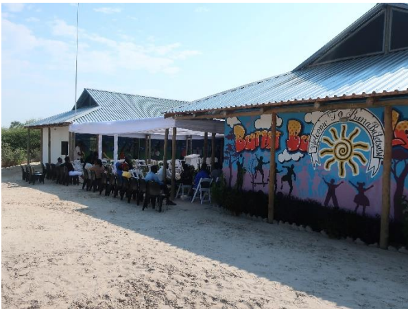
The newly constructed building