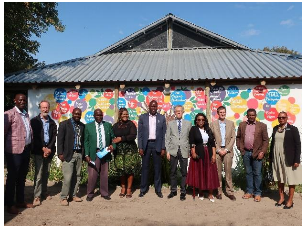
Some of the guests at the handover ceremony