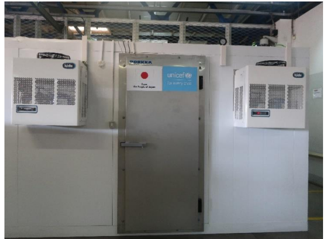
Walk-in-Cold Rooms donated by Japan