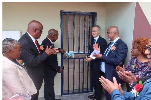
Official Ribbon Cutting