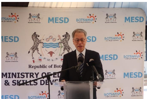
Ambassador of Japan to Botswana, Mr. OHMORI Setsuo

*GGP is a grant scheme which supports projects addressing social challenges and/or aiming at community development at grass-roots level and supports people-centred development projects which have a direct and immediate impact on the well-being of disadvantaged communities. In Botswana, from 1997 to date, 65 GGP projects in total have been approved, some of which are currently on-going. These projects include rural developments such as the construction of pre-schools, classrooms for students with disabilities and vocational training institutions.