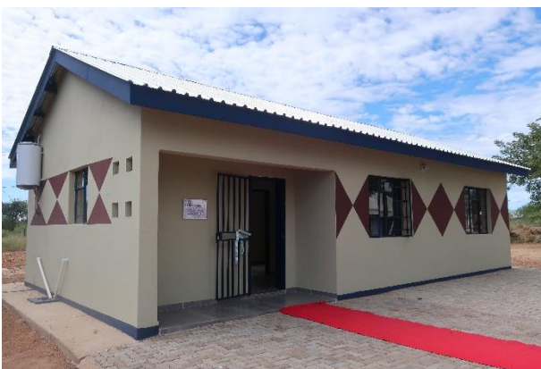
The newly constructed a guidance and counselling block