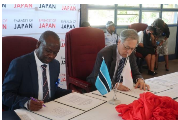
Signing the Grant Contract

*GPP is a grant scheme which supports projects addressing social challenges and/or aiming at community development at grass-roots level and supports people-centred development projects which have a direct and immediate impact on the well-being of disadvantaged communities. In Botswana, from 1997 to date, 63 GPP projects in total have been approved, some of which are currently on-going. These projects include rural developments such as the construction of pre-schools, classrooms for students with disabilities and vocational training institutions.