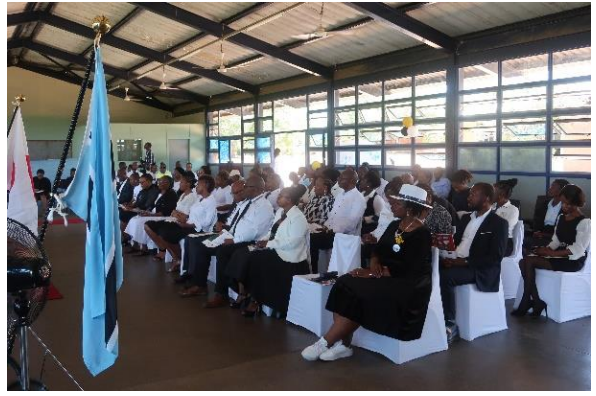
Marulamantsi JSS Staff Members