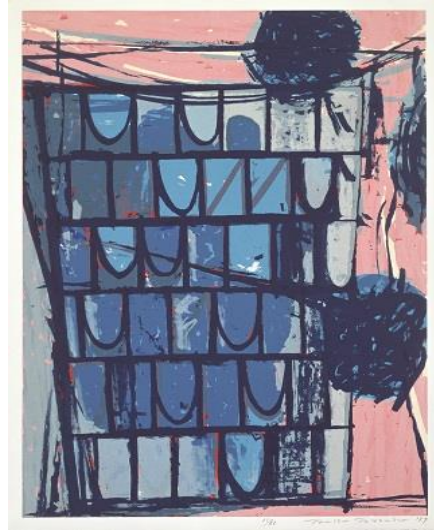
Toeko Tatsuno: 'July-3-89'