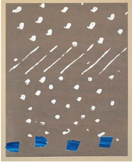
Hitoshi Nakazato: The Series, Homage to Sengai with Color "A"