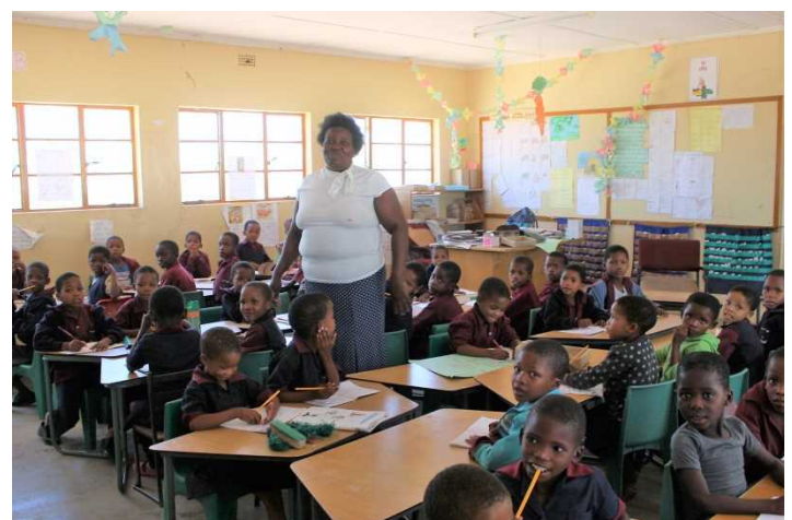
The standard 1 pupils at Malatswae Primary School