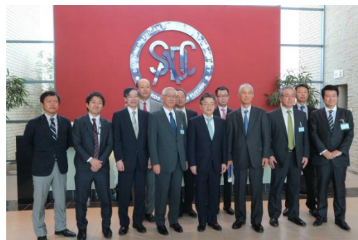
At the front of SADC Office