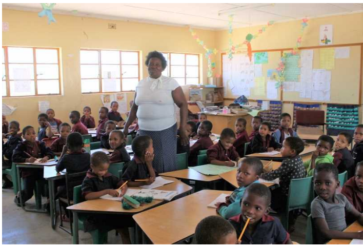
The standard 1 pupils at Malatswae Primary School