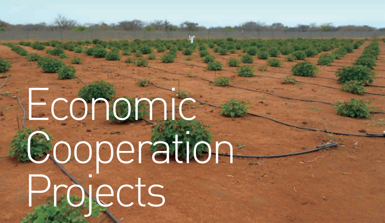
Jatropha Trees at Sebele Project Field