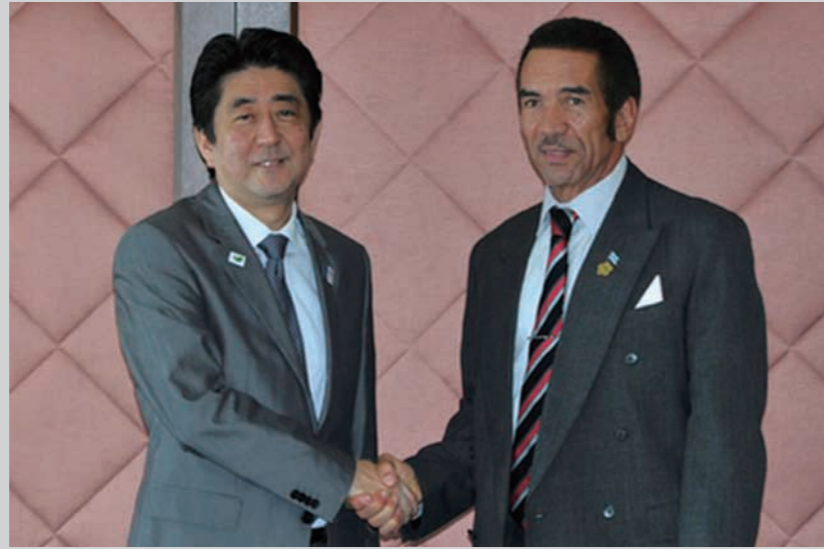
H.E. Lt. Gen. Seretse Khama Ian Khama, President of the Republic of Botswana and H.E. Mr. Shinzo Abe, Prime Minister of Japan during his visit to Japan at TICADV.