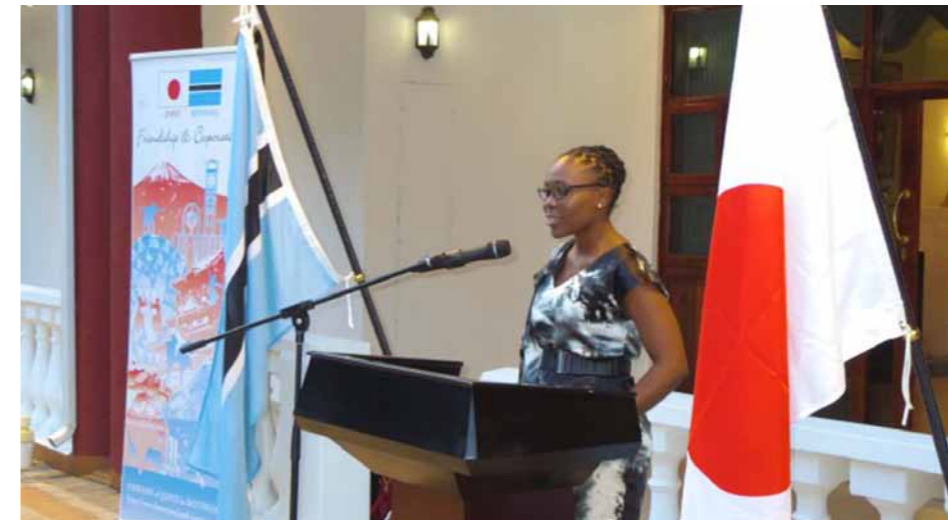
President of "Friends of Japan"

Direct cooperation between academic institutions in Japan and those in Botswana have been growing over the years. The Akita University in Japan has entered into schemes for cooperation with the University of Botswana (UB) and the Botswana International University of Science and Technology (BIUST) respectively. The academic cooperation lies mainly in the field of mining engineering, where Akita University has strength. The Faculty of African Research at the Kyoto University in Japan has also entered into a scheme for cooperation with their counterparts in UB, and Kyoto University and UB are working towards expanding their areas of cooperation. Also there are some Japanese universities, such as Waseda University and Ritsumeikan Asia Pacific University, have developed exchange programs with UB.